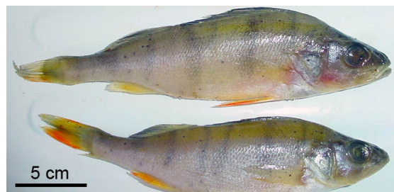
Figure 2. Black-spotted disease in Perca fluviatilis Linnaeus, 1758 presumably caused by Rossicotrema donicum. Small black metacercarial parasites can be seen embedded into the skin and fins. Fishes were caught in Lake Lukomskoe on 30.07.2006